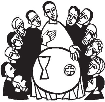
God feeds us with the presence of Jesus Christ.