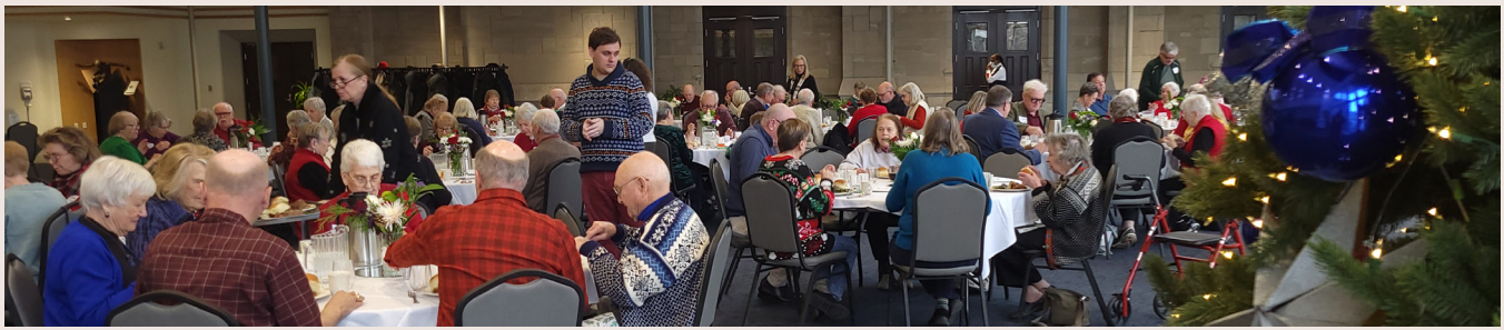
The Older Wiser Lutheran Seniors (OWLS) gather each December for their Christmas Luncheon.

and peers at church. If you've not attended this family-fun event in the past, join us! It will bring out the kid in you.