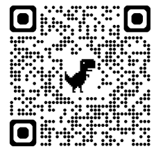
Scan to donate to Align Mpls.

has seen a significant increase in people seeking assistance as other community programs and resources have closed or had decreases in funding. If you miss donating at the service, you can still help Align continue this important program by giving today, using the QR code above!