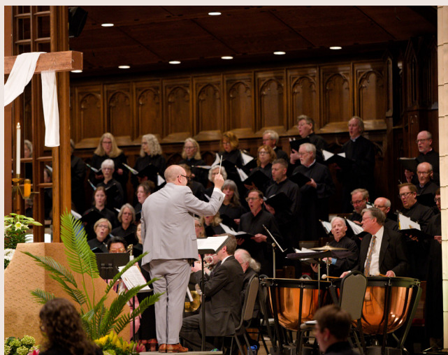
Choir music is one way we respond in song.