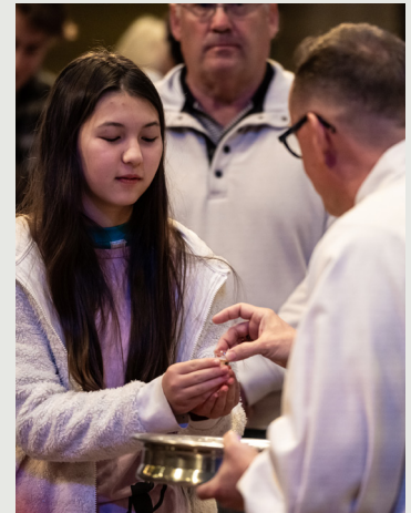
We receive communion during Christmas Eve worship.