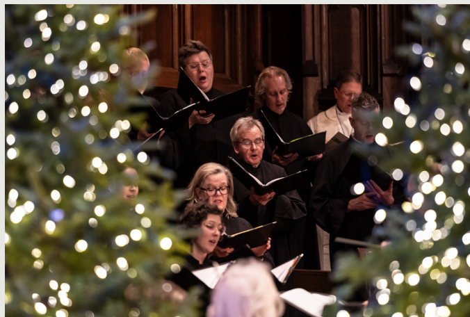
The choir leads us in Christmas Eve worship.