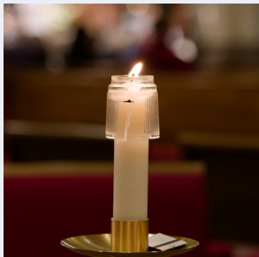
We light candles and tend grief at the Blue Christmas service.

The beautiful blue Advent paraments will appear again in late November on the altar. To enjoy the fullness of their beauty, all four panels were on the altar throughout Advent last year. This season, one panel will be added each week in a similar cadence to that of lighting Advent candles. Watch the gold fabric as it grows from one week to the next. The light appears in just a small patch of the corner of the first panel and builds toward the brilliance of a star which is fully visible by Christmas Eve.