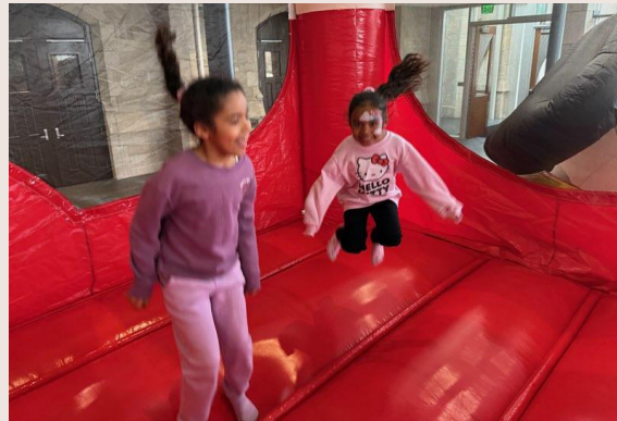
The Winter Family Festival is a bouncing good time!

on the third Sunday of each month and they begin at 12:15 p.m. Watch the Spirit for specific topics and speakers.