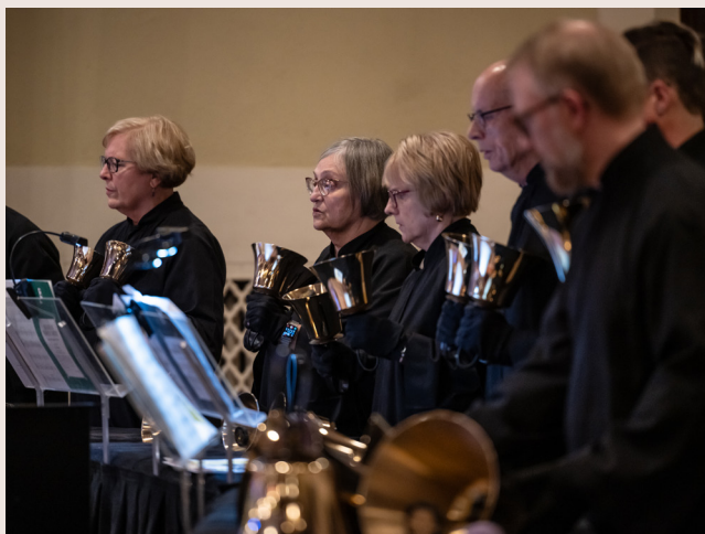
The bell choir is another way that we respond in song.