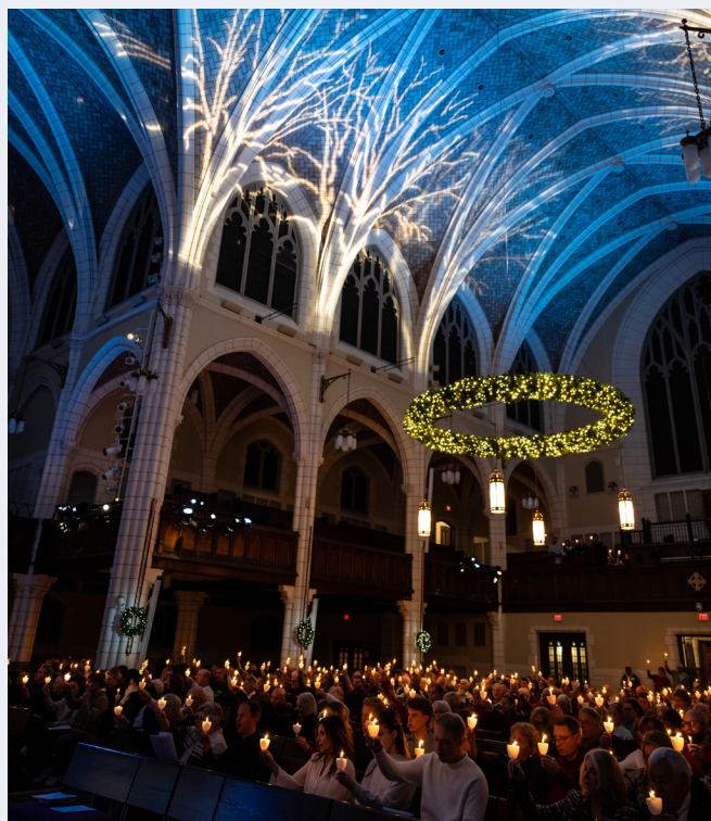
Singing "Silent Night" at Christmas Eve worship in 2025.

Looking toward the new year, on January 3-4 we will celebrate the festival of Epiphany, remembering the