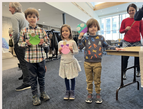
There is a lot of intergenerational fun to be had at the Annual Advent Fair.

all in an attempt to chase away the winter blues and give families an opportunity to enjoy a fun-filled day at church in the spirit of holy and healthy play. This year we are adding games and a craft station for kids to play and create while having fun with their friends