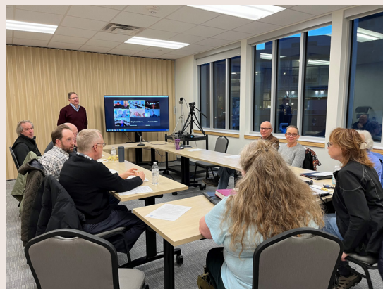
Join in person or online for the Wednesday night Bible studies this winter.