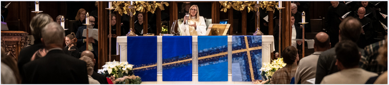
Last Advent, we introduced beautiful new blue paraments.