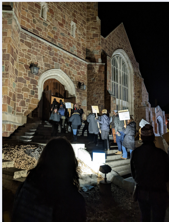
A silent march precedes the service of remembrance at the Homeless Memorial March.

On Thursday, December 18 at 4:45 p.m. we will gather at Plymouth Congregational Church for the silent march and vigil and return to the church for the memorial service. The service will be livestreamed on the Simpson Housing Facebook page for those who cannot attend in person.