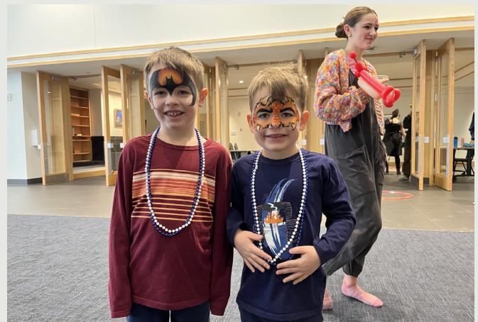
We have lots of fun at the Winter Family Festival!