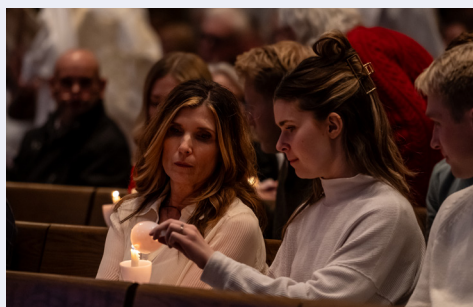
Sharing the light at Christmas Eve worship.

responds with the Nunc Dimittis text: "Now Lord, you let your servant go in peace" (Luke 2:29-32). Finally, February 14-15, we will celebrate as Jesus is transfigured atop a mountain (Matthew 14:1-9).