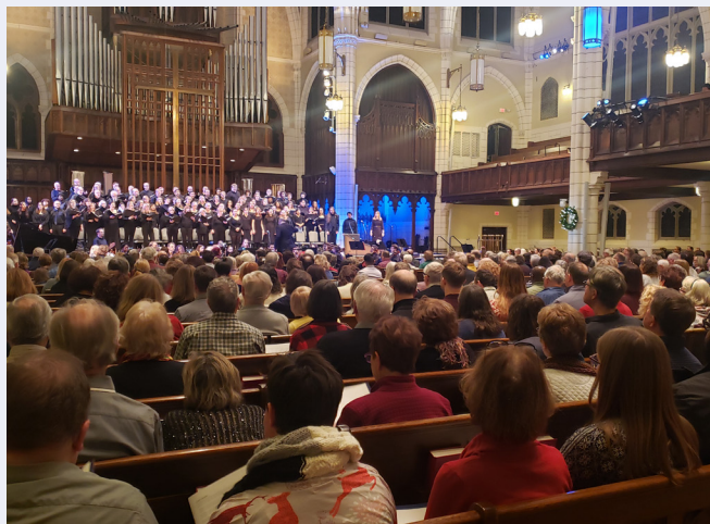
Augsburg Advent Vespers is a seasonal favorite.

In times like these, God sends prophets to point us in a new direction, to remind us of God’s loving intentions for the world. While peaceful times may feel far off, we join the defiant song of Zechariah that points toward a future day when the fullness of God’s shalom dawns once again in our lives.