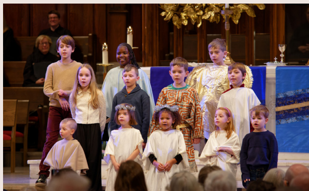
The Sunday School kids reenact the story of Jesus' birth at the 10:30 a.m. service during the Christmas Program.