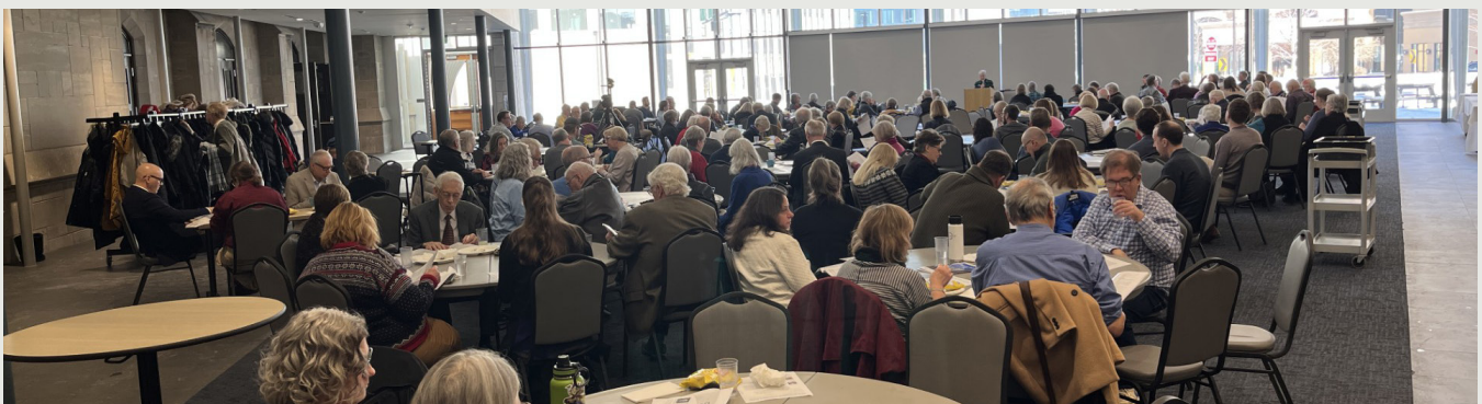
We gather for the Annual Congregational Meeting each February.

You are invited to the annual celebration of ministry and mission on Sunday, February 8 at noon . We will gather for the community meal; the Annual Meeting will follow around noon. We meet for ministry reports, hear the