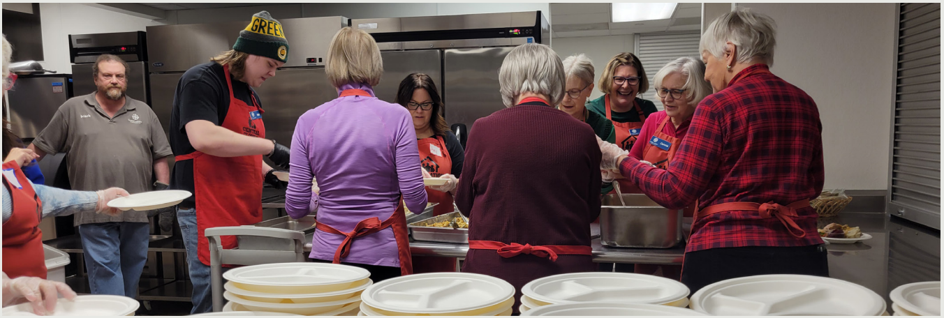
Volunteers serve up turkey dinner at the Restoration Center's Christmas Meal.