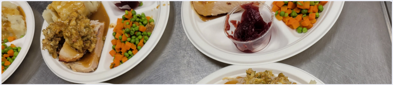
A delicious turkey dinner is served each year at the Christmas Meal.