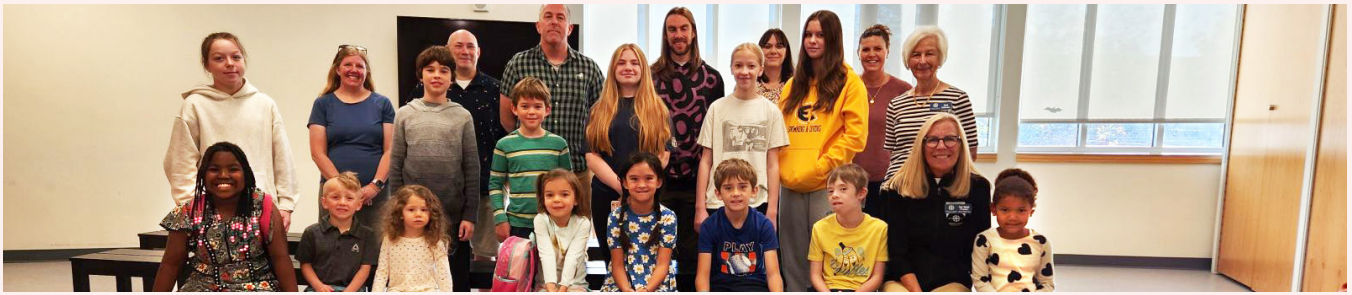
At least once a year, Central kids, youth, and family work together to pack health kits.

to the big questions about faith, a life centered in Christ, and the ways in which we are called to love and serve our neighbors.