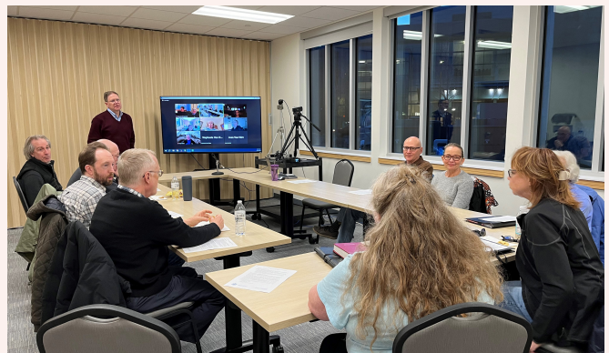
Adult learning includes an evening Bible study any can join, either in person or online.

Join us as we read and study the many ways we find our home in community and in Jesus Christ. These Bible studies are created so that you can come every week or when it fits your schedule, so plan to come whenever you can.