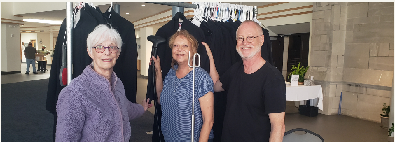
Volunteers prepare the choir robes, as a new season of music begins.

October 12 Sunday 12:30-4:30 p.m. Fall Prayer Retreat