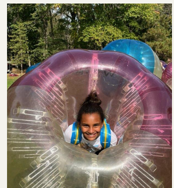
The kids have fun on retreat!

November 27 Thanksgiving Holiday Thursday, 10 a.m. Downtown Congregations Interfaith Worship