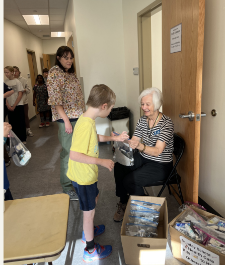
Kids of all ages help assemble health kits.

September 14 Sunday 9:30 a.m. Weekly Sunday School, Confirmation, High School Youth Group, and Adult Forums begin