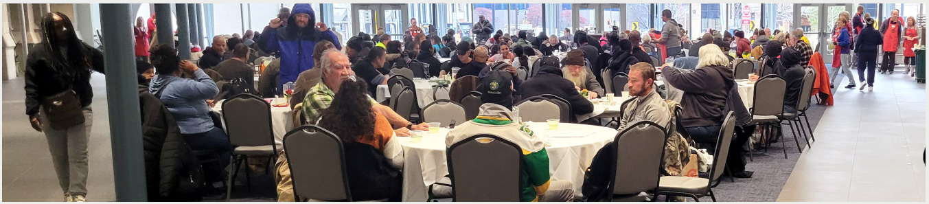
The community will gather for the Thanksgiving Meal on Monday, November 24.

experiencing homelessness. The weekend set aside this year is November 15 through 17 . There will be an Adult Forum on Sunday that will focus on one of the myriad topics around preventing and ending homelessness. Additionally, at noon on Sunday, November 16, the Empowering Conversations will also have a focus on Sabbath to End Homelessness. These opportunities are still in the planning phase, so watch the Spirit for more details coming soon!