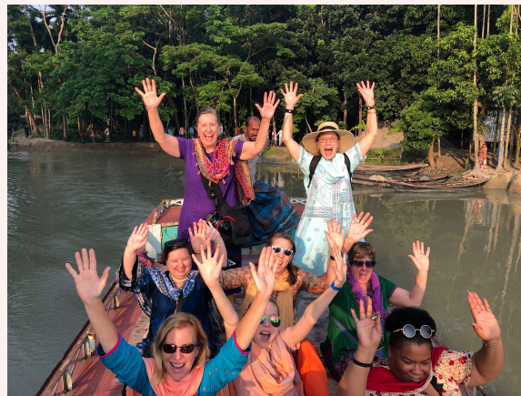
The 2018 Bangladesh travelers from Central.