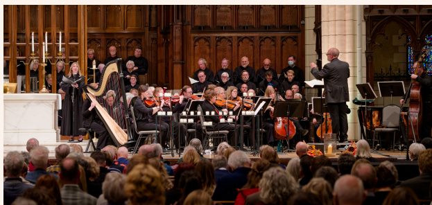
Central Choir singing at All Saints' Day worship.