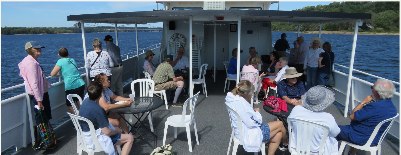
The Central OWLS enjoy many adventures together in the fall.

October 4 Saturday 2 p.m. Installation of the Rev. Yehiel Curry as Presiding Bishop of the ELCA