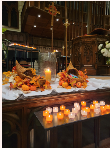
The fall Generosity Ingathering is a time of gratitude and giving.