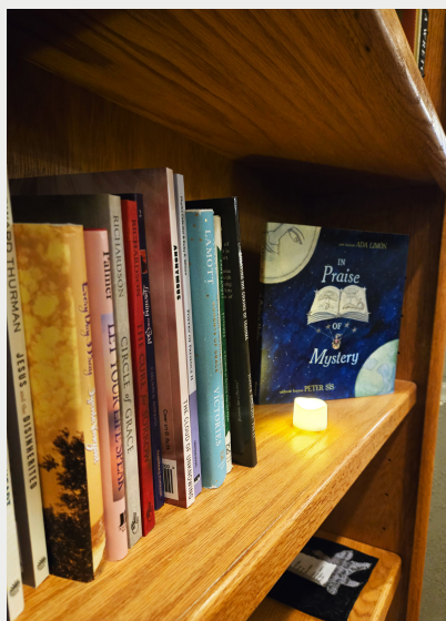
A copy of the monthly Book Club selection is available to borrow on the shelf at the back of the sanctuary.

One of the miraculous things about stories, especially when you’re in a book club, is that they don’t stay stranded in our minds, they are nourished by discussion and further sharing of our own stories.