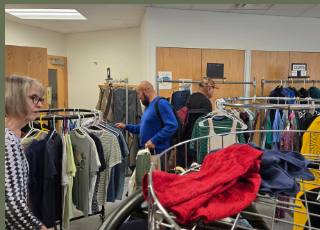
The Free Store is an important ministry of the Restoration Center at Central.

In the mid 1960s when the Free Store (then called the Clothes Closet) was begun the Sunday school teachers had one goal: to make sure the kids coming to Sunday School had enough warm clothes. How did the teachers know what the kids needed? Simple, they knew the kids and at least once a week they spent time together. Every time the Restoration Center has expanded since then, it has been out of that same genesis. It is people who know one another and can share their need and their lives. It helps that Jesus is very clear in Matthew 25 where he tells folks that when they give water to someone who is thirsty, food to the hungry, visit the sick or imprisoned, or clothe the naked they actually provide for Jesus himself.