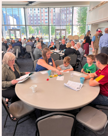
An Intergenerational Learning event kicks off the year at Rally Sunday!

ways in which we make our home in Christ. Confirmation families should pencil-in this great weekend on their fall calendars now. More details coming as the program year begins.