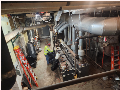
Replacing the boilers is part of the Sanctuary Renewal Project.

We have also begun the boiler replacement project. At this point, the old boilers have been removed and recycled, and we have also removed as much of the nearly 100-year-old piping as possible. The new high-efficiency boilers are on site, and the installation process will begin soon.