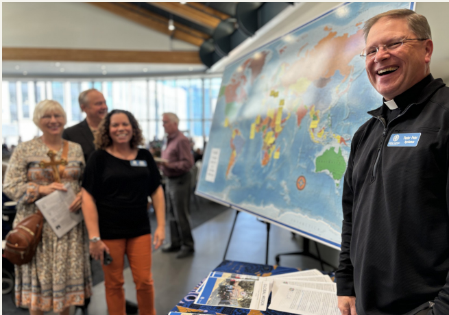
Global Mission Weekend is full of learning and fun!

November 15-17 Sabbath to End Homelessness Sunday, noon Empowering Conversations