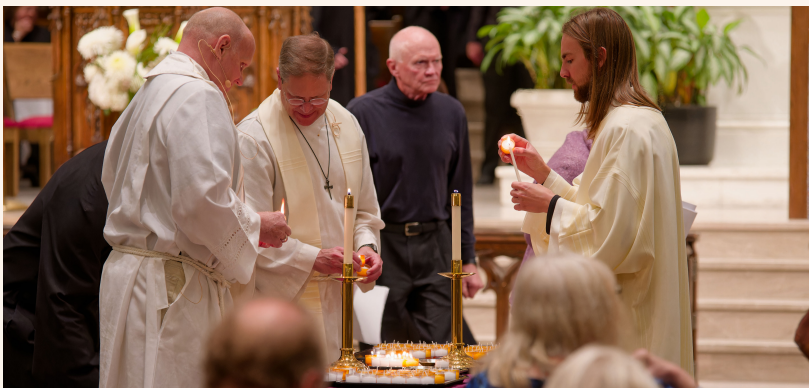
We light candles and remember our beloved saints.

The 10:30 Choral Eucharist will feature John Rutter's sublime Requiem , with the Central Lutheran Church Choir and musicians of the Metropolitan Symphony Orchestra. We will have additional singers join us for this offering. If you are not a regular choir member, but would like to join us for the requiem, see the next page.