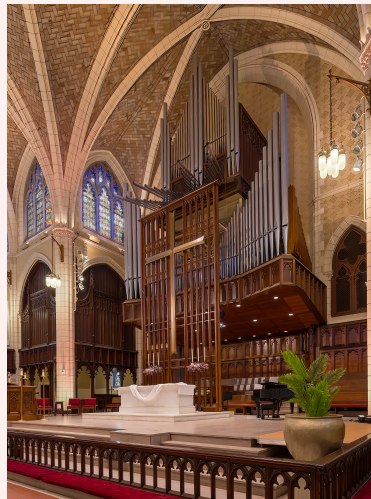
Central's Casavant organ.

While many of you have been out enjoying this beautiful Minnesota summer, we have been making the most of our time during the lull in the program year. In keeping with the philosophy of being kind to our future selves, we continue to cross off projects on our