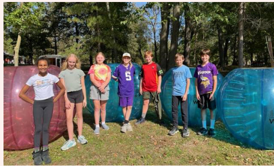
Knockerballs are a student favorite at Camp Wapo during the Confirmation Retreat.

Come and be a part of this exciting weekend of homecoming and welcome.