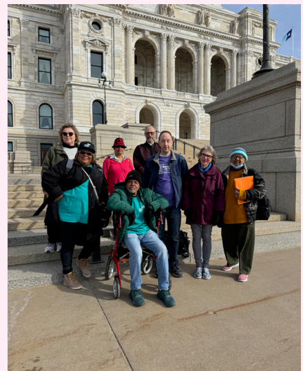
Many members and friends of Central showed up at the State Capitol for Homeless Day on the Hill 2025.

The Bill of Rights for People Utilizing Shelter did get an author in the Senate and began the jacketing procedure with the State Revisor's Office. We knew this bill would take multiple years to get a hearing, so while we are disappointed it didn't get further along this session, we are heartened by the progress.