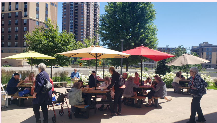
People gather to hear the Carillon and enjoy good food.

Don’t miss out on these memory-making summer events! For the 2025 schedule, check out pages 6–7 and 10 in this issue of Centering .