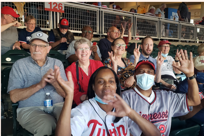
Lutheran Night at the Twins is a Summer favorite.