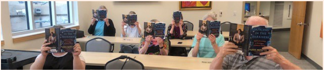
Summer Adult Formation keeps us learning, connecting, and having a good time!