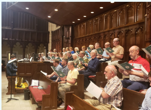
The popup choir is a fun opportunity to sing together over the summer.