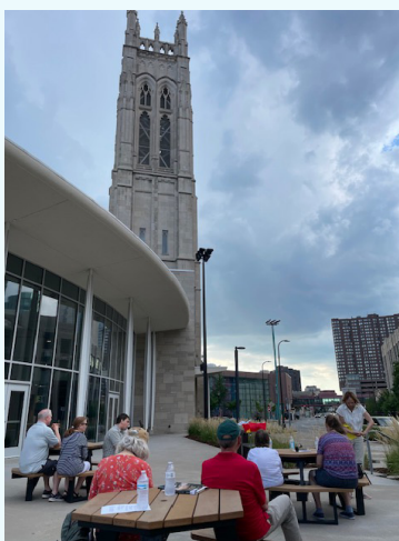
Don't miss our guest carillonneur series this summer.

Please come and enjoy these free, outdoor concerts!