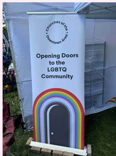
Volunteers from Central have been helping to run the Downtown Churches' Pride Booth for 25 years.

Closed June 30 – July 10 and August 4 – 7