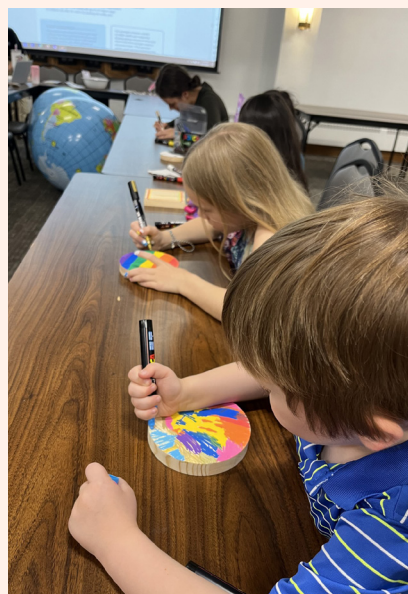
The kids love learning and creating together during VBS.

Watch the Spirit for more information as the dates get closer.