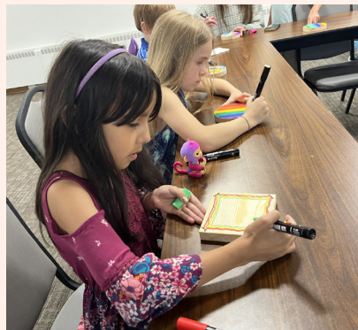
Kids get creative at VBS.

Carillon Concert and KCM Egg Rolls Food Truck