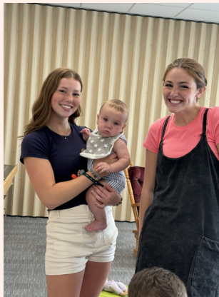
There's a place for even the smallest of us at Central.

children in the spirit of Jesus who said, "Let the little children come to me; do not stop them; for it is to such as these that the kingdom of God belongs."