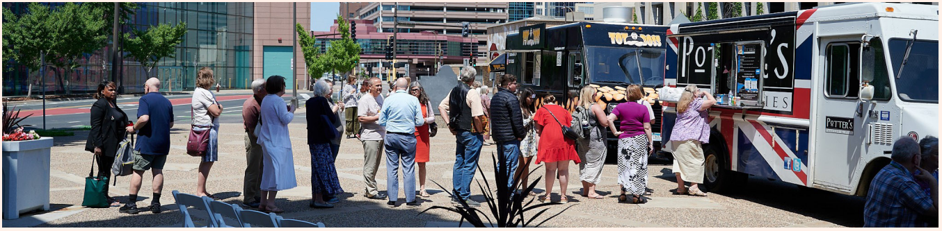
Get ready to line up for food trucks at Summer on the Plaza!