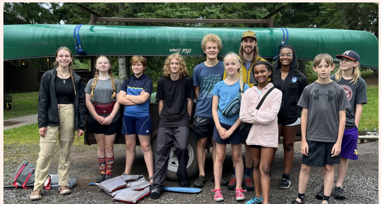
The Middle School youth head to Amnicon for camping and canoeing.