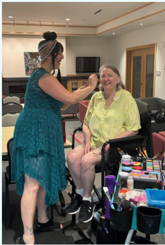
Last year we had face-painting at the Church Picnic.