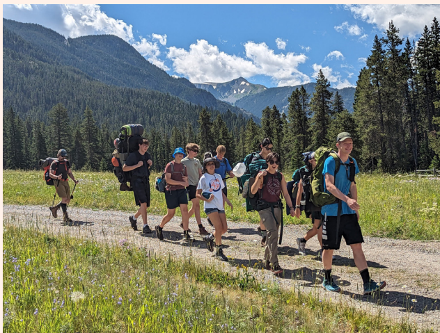
The High School youth will travel to Montana to hike in the Absaroka-Beartooth Mountains.

For more details, including meeting times, book purchasing, and more, check out page five of this issue of Centering .