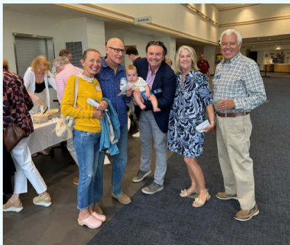
New Member Happy Hour is always a summer highlight.

life together as a faith community. Because of God and because of you, the Central faith community continues to thrive in worship, study, community, and care for all in need. A special procession will help us to celebrate and give thanks to God for you and your gifts. On Saturday, a