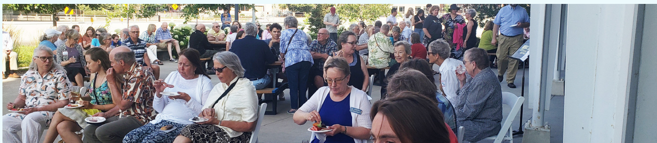
In the summer, crowds gather for food and great Carillon music on the plaza.