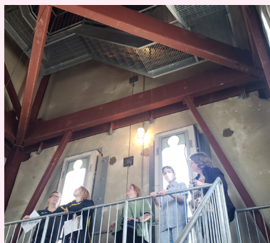
People climb up the tower during a tour and demonstration.

The music invites, but it can also aid in producing that sense of belonging. Short knows that “the sound from bells celebrate, heal, mourn, and meditate; studies have shown there are health and wellness benefits to playing or listening to bells.”