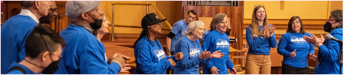
StreetSong MN performed at the Homeless Day on the Hill Rally, where many gathered to advocate for housing justice.