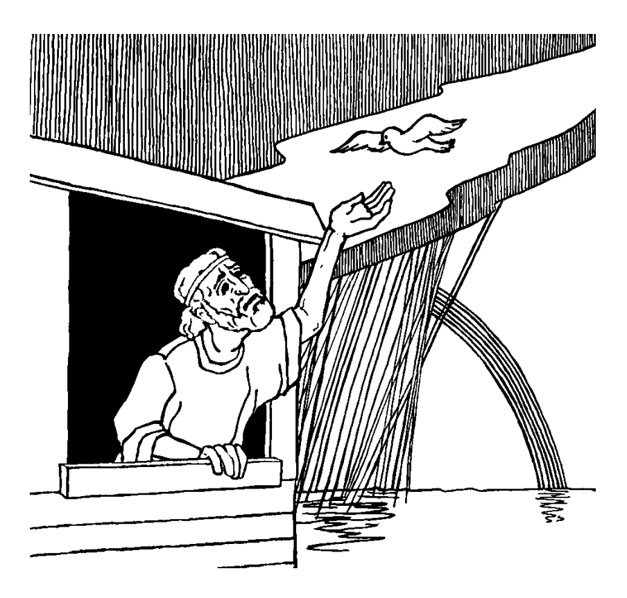
Time to discuss questions from the reading.

"But God remembered Noah and all the wild animals and all the domestic animals that were with him in the ark."