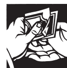
works of love

The word Lent means springtime. This word comes from the same root as lengthen. Daytime lengthens during Lent. The northern hemisphere turns toward the sun, the source of life, and winter turns into spring. In Hebrew, the word for repentance is the same as the word that means to turn, like the turning of the earth to the sun, like the turning of the soil before planting.