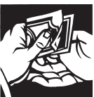
acts of love